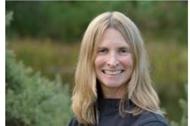
Francesca Osowska, Chief Executive Scottish Natural Heritage.

This short publication provides an overview of many of the ways in which nature can help us address a range of socio-economic outcomes including inclusive economic growth, addressing climate change, reducing health inequalities, building stronger communities and empowering our young people. The climate emergency has reinforced our responsibility to focus on the practical measures we can take to support nature-based solutions. This publication includes many examples of inspiring activities that local partners are undertaking, and it lists practical resources. I hope you find this a thought-provoking and helpful guide.